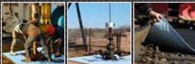
Oil, Gas & Mining Spill Control

WASTE DISPOSAL METHOD: All Spilfyter® sorbents in themselves are considered to be non-hazardous as defined by RCRA (40 CFR 261). However, once used, these products will take on the characteristics of the chemical absorbed and should be disposed of in accordance with all applicable local, state and federal regulations.