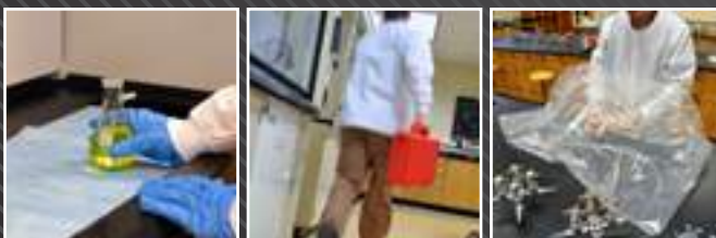
Lab & Healthcare Spill Control