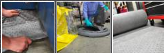
Industrial & Safety Spill Control